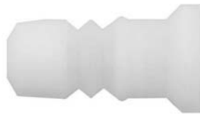
Valve head Type N Item no.: 600044/ 855544